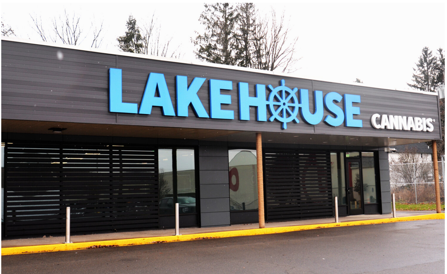
( https://beta.creativecirclecdn.com/cortland/original/20231127-191136-11.27.23Lakehouse%20update.jpg )

Owners of LakeHouse Cannabis, which would be the county's first cannabis shop, hoped to open late in 2023, but have yet to receive final state approval. It's No. 2,026 on a list to be reviewed